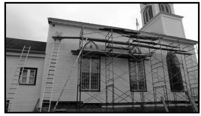
Closing up the top of the west wall.