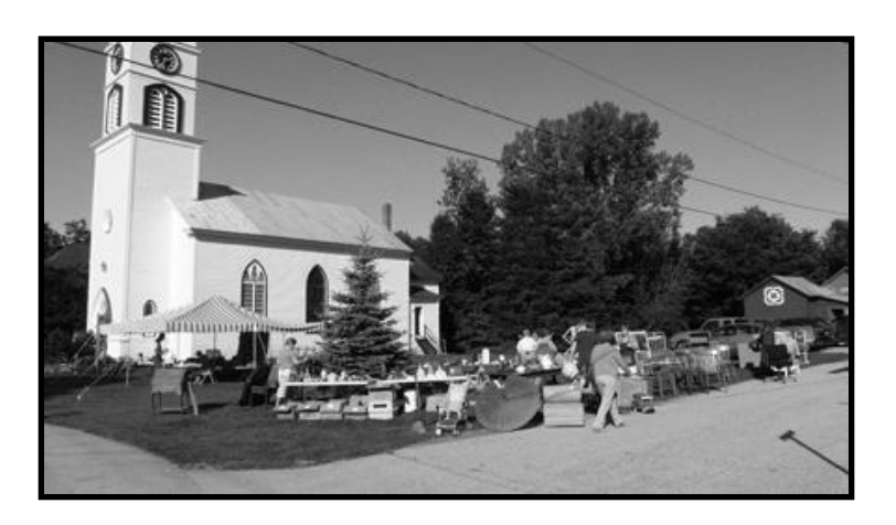
"Uniques" sale in progress