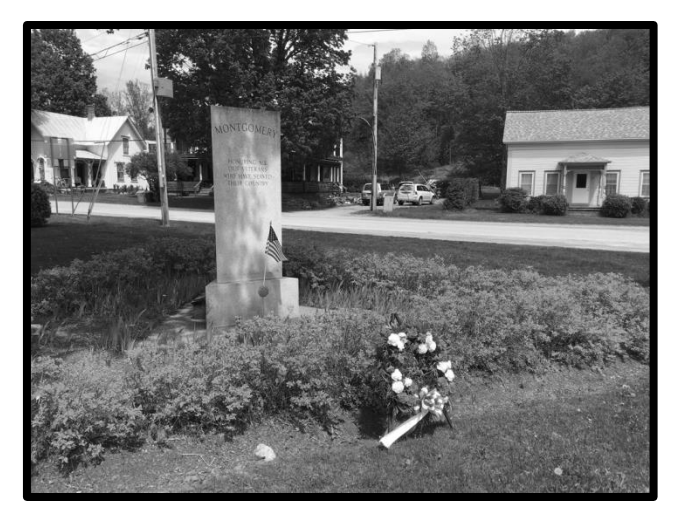
Village Green Veterans Monument