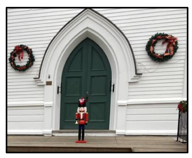
Pratt Hall Guardian