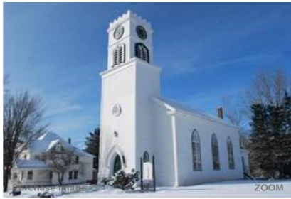
Pratt Hall in Montgomery on Jan. 21.