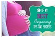
My 9 Best-Ever Pregnancy Tips and ... EverydayFamily.Com