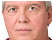
7 Alzheimer's Triggers You Must Know Newsmax Health