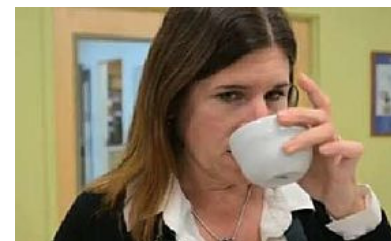
Vermont's coffee connoisseurs