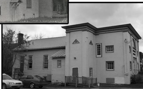
Crescent Theater Modifications