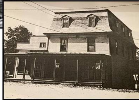
Gardyne Hall 1983. aka Joe's Trading Post, Kilgore Trout's Saloon,