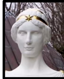
"Agriculture" aka Ceres III

June: 1983 Montgomery FAST Squad established, precursor to Ambulance Squad.