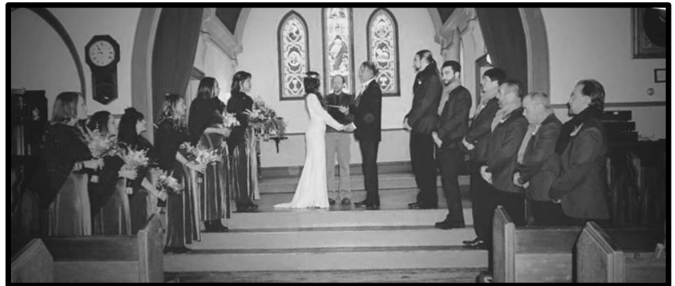
April 2016 Wedding at Pratt Hall

The beginning of 2017 saw more activity at Pratt Hall than normal for this time of year as we provided a venue for two memorial services. These "celebrations of life" served as a reminder that our work is more than preserving a historic building or storing artifacts. We also provide our community with a place to come together for shared experiences some sad, some joyous, and many in between. These can be weddings, educational programs, concerts, social events or any number of things. These face-to-face social interactions foster effective communication, emotional wellness, and a sense of community.