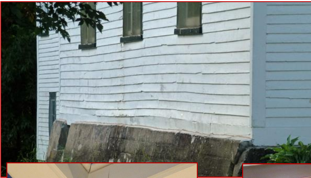
West Wall Sag and Bulge