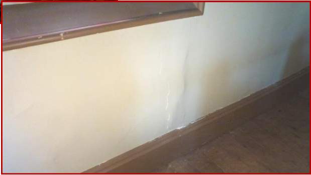
Crack Under Stained Glass Window